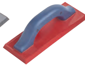
ITEM NO. 151-54P