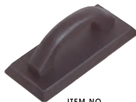
ITEM NO. 151-43P