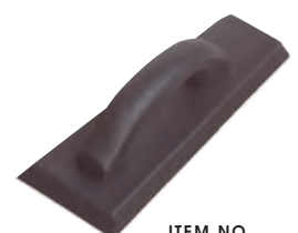
ITEM NO. 151-45P