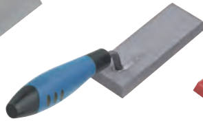
ITEM NO. 151-25P