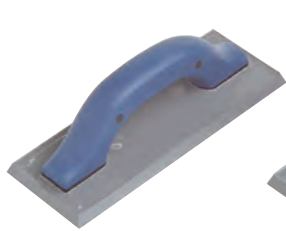
ITEM NO. 151-53P