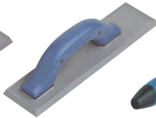
ITEM NO. 151-55P