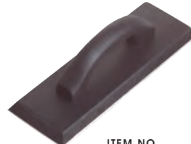
ITEM NO. 151-44P