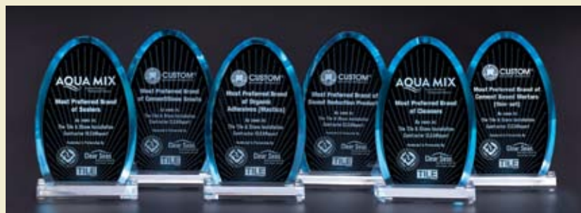
Thank you to our contractors and distributors for voting us Most Preferred. Voted the most preferred brand of sealers, grouts, adhesives, sound reduction products, cleaners and thin-set mortars in the Tile & Stone Installation Contractor CLEARReport™.

We lead the industry with innovative products and services. We're recognized for revolutionary innovations like EasyMat®, Prism®, MegaLite® and Aqua Mix®. Tile professionals can feel confident with product technology like CustomLite®, BuildGreen® and Controlled Cure Technology™. Our award-winning, national Architectural team supports designers and builders with system guides, specification assistance and an array of continuing education seminars.